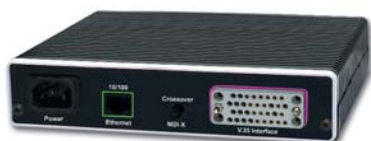
Model 2635 – V.35 Interface

Visit www.patton.com for more information.