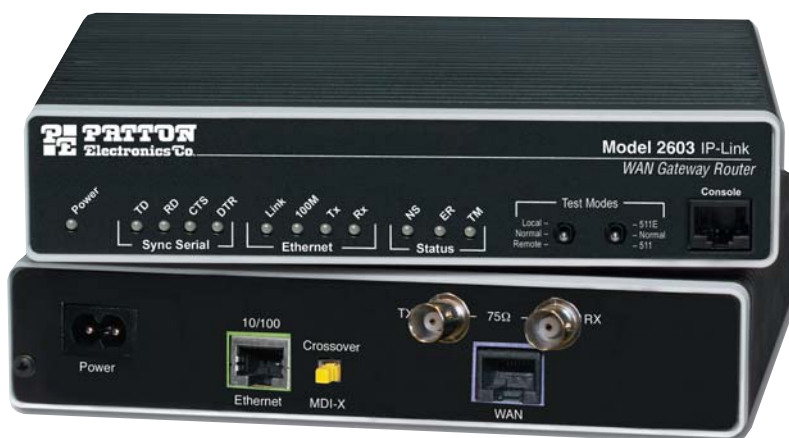
IPLink Gateway Router