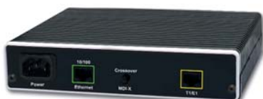
Model 2603 – T1/E1 Interface