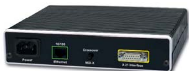
Model 2621 – X.21 Interface