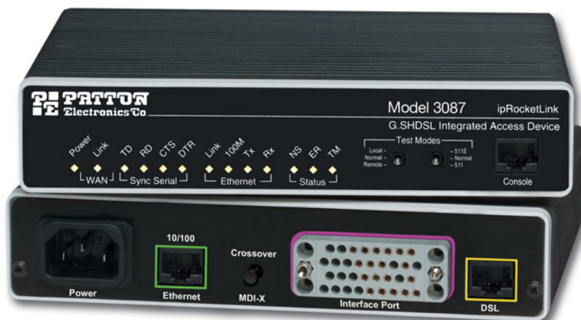
Model 3087 ipRocketLink IAD

Special Rates Available Call for Details