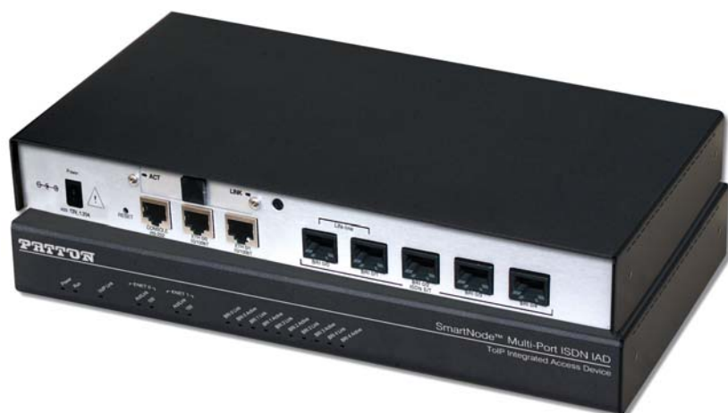
SmartNode 4650 with G.SHDSL.bis

Visit www.patton.com for more information.