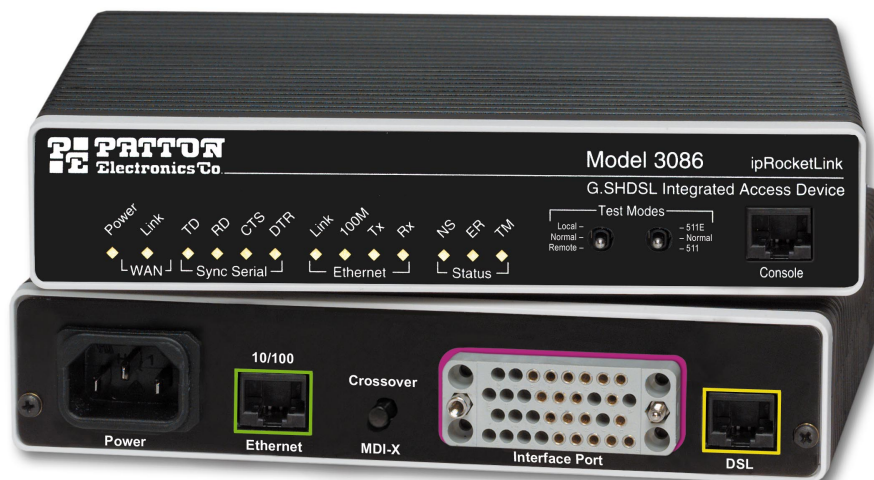
Model 3086FR ipRocketLink IAD